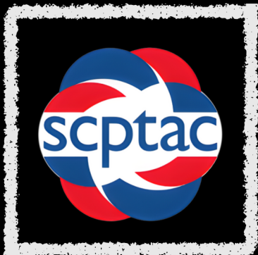
SCPTAC Benefits Presentation

Sign up at www.ajtraining.edu or call (310) 604-0892